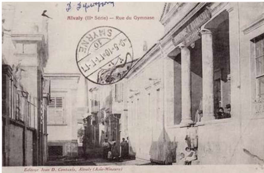
Old photograph of the Kydonia Academy school in Asia Minor At the beginning of the 20 th century