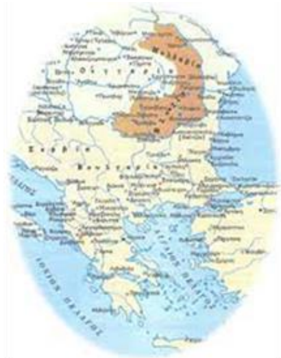
The regions of Moldavia and Vlachia