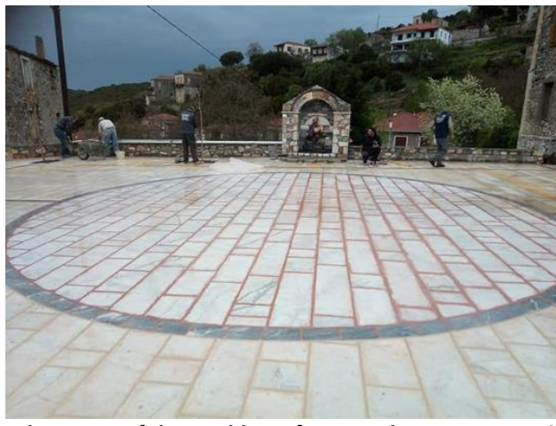
The placement of the marble surfaces on the terraces on either side of the fountain. In front the space for the panygiri.