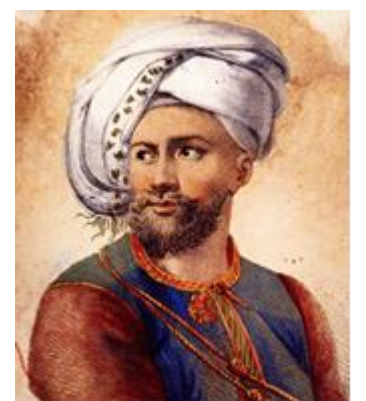
Ibrahim Pasha of Egypt