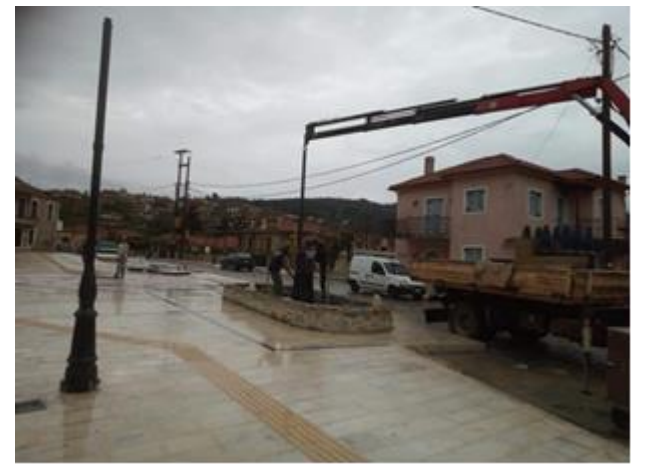
The placement of the lighting poles