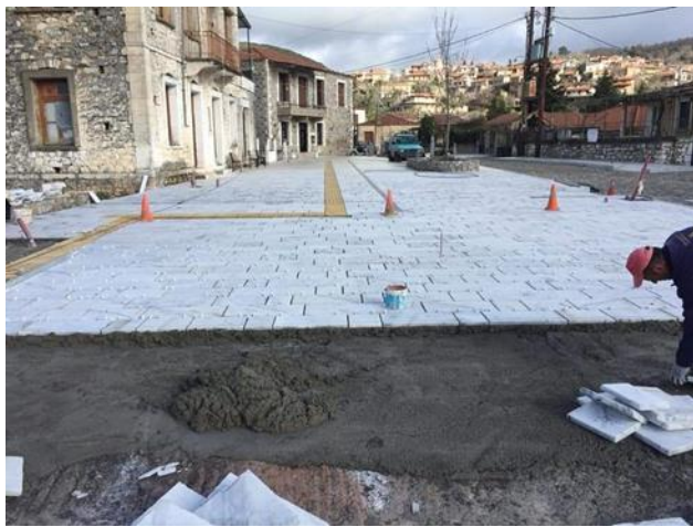
The completion of the pavement

We hope that the coffee shop and the tavern which operated at Rachi will take advantage of the new "platia" in order to create a second leisure space in Karyes.