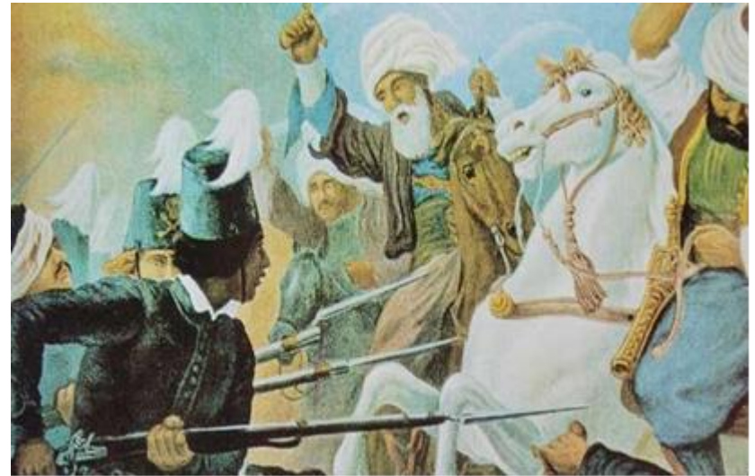
The battle in Dragatsani

However the Russians did not help the revolution and the Turkish army invaded. After the heroic final battle in Dragatsani , the two brothers managed to escape in Austria.